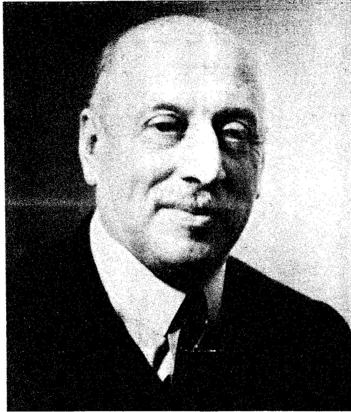
C. H. Douglas, born January 1879

The new (15th) edition of the encyclopaedia Britannica (1974) is divided into two main sections: the Micropaedia of ten volumes, of Ready Reference and the Index, and the Macropaedia of nineteen volumes. Under the heading Douglas, Clifford Hugh (1879-1952) in the Micropaedia is the information "British economist and founder of Social Credit." The only reference to the Macropaedia is: "Ezra Pound's absorption with economics", and in this article Social Credit is stated to be "an economic theory stating that maldistribution of wealth due to insufficient purchasing power is the cause of economic depressions."